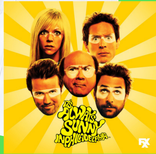
IT'S ALWAYS SUNNY IN PHILADELPHIA