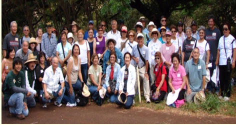
Field trip to Honouliuli Internment Camp