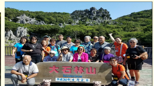
OGSH 25 th Anniversary Tour in Okinawa