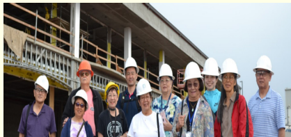
OGSH Tours Hawaii Okinawa Plaza