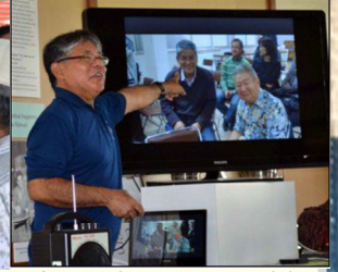
S.American Tour to visit Okinawans in Argentina, Peru, and Brazil