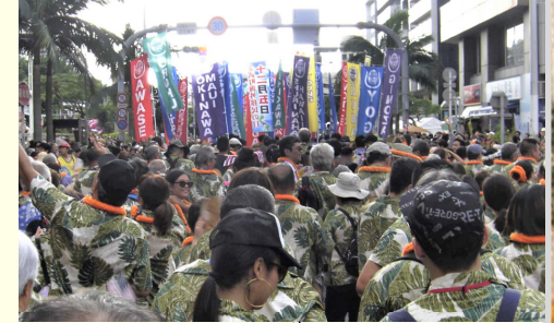
Members attend 6 th Okinawa Taikai