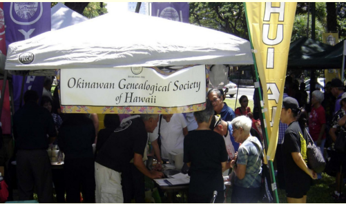
Participated in Honolulu Hale "Mini Okinawan Festival" after Hurricane Darby