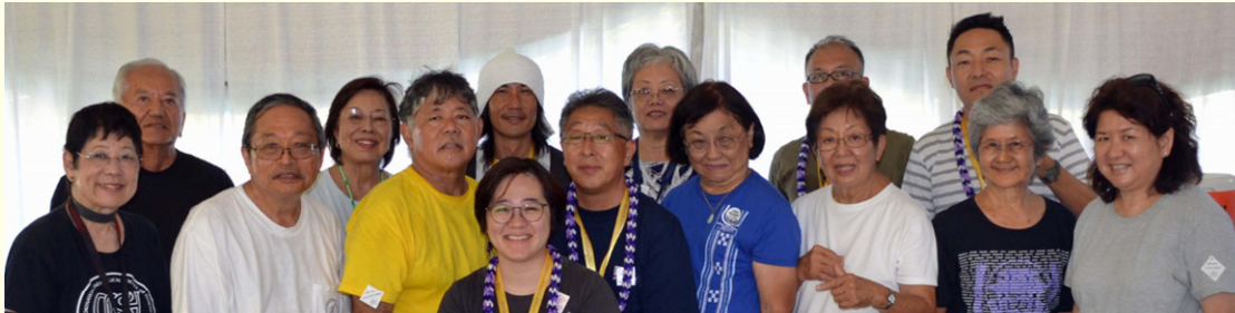
First Partnership with Okinawa Prefectural Library at the 2017 HUOA Okinawan Festival

Last Festival to be held in Kapiolani Park. Future festivals to be held at the Hawaii Convention Center.