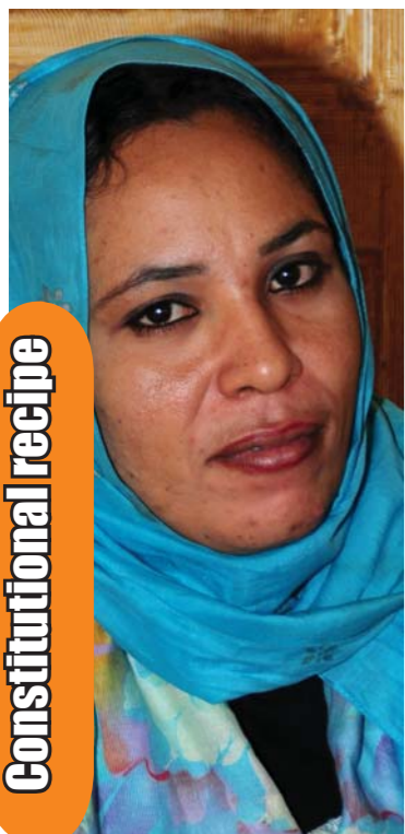
By: Mashair Al Tahir Osman

By the editor Whenever the National Congress reiterates its call on the opposition for dialogue it starts to accuse them of irresponsibility and disloyalty to the country, etc. nevertheless, dialogue is necessary for settlement to all issues, otherwise verbal attacks will continue and chances for dialogue, which some went as far as to describe as double standard, but we have bear in mind that our presents problems have been the products of failure of political elites to craft constitution regulating relationships between governors and the governed, granting citizens their rights to express themselves, dreams and participate in constitution making. Such requires political and legal measures to create environment conducive to participation and broad-based dialogue without excluding any.