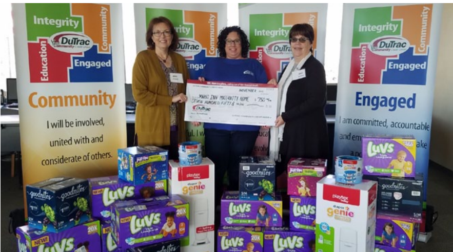
Thanks to the members DuTrac Community Credit Union for the donation of diapers, diaper genies and the check!