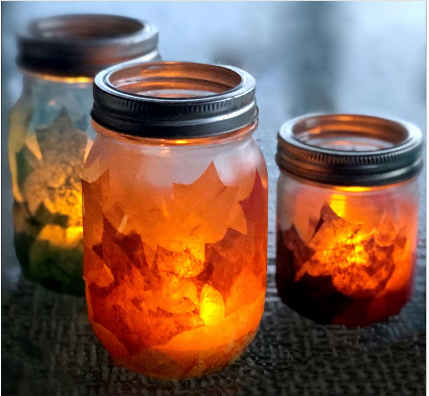
Falling Leaves Luminary