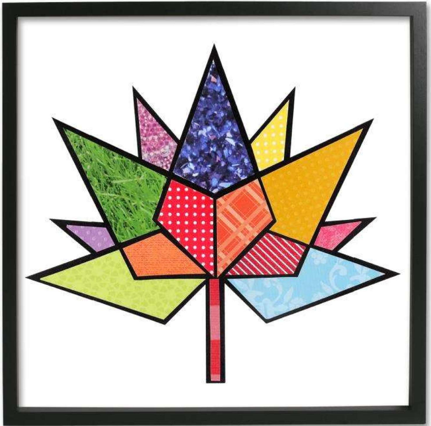
Maple Leaf Collage