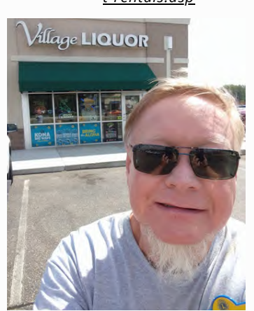
Village Liqour https://www.priorlakeliquor.com/