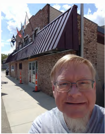
Prior Lake VFW Post 6208 https://vfwpost6208.com/