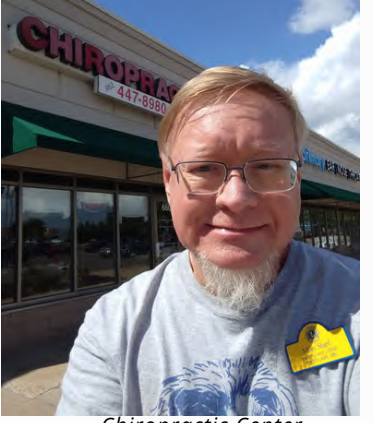
Chiropractic Center <a href="https://www.savagechiropractor.com/">https://www.savagechiropractor.com/</a>