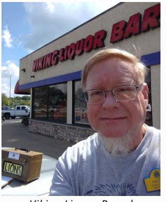
Viking Liquor Barrel https://vikingliquor.com/