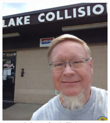
Prior Lake Collision <a href="https://www.priorlakecollision.com/">https://www.priorlakecollision.com/</a>