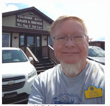
Velishek Auto https://velishekautosales.com/