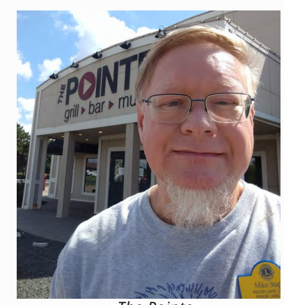
The Pointe <u>http://thepointegrillandbar.com/</u>