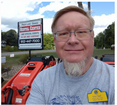
Prior Lake/Savage Rental Center https://priorlakerentals.com/equipmen t-rentals.asp