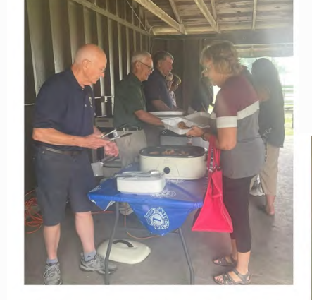
WORKERS BUSY SERVING THEIR PATRONS.