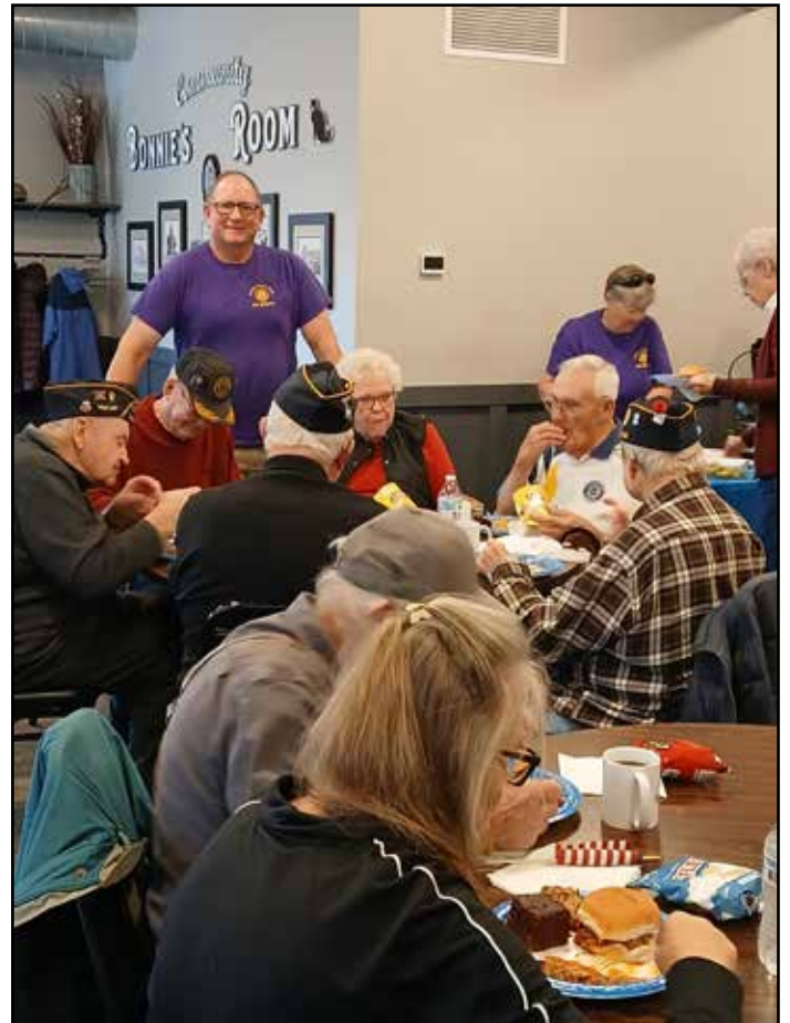
The Amboy Lions Club hosted a Veterans Lunch on November 8. The attendees represented the Army, Navy, Marines, National Guard and Army Reserve with a total of over 46 years of service to our country. Thank you to all Veterans who served.

This December we are sponsoring a family from the Amboy area for Christmas and providing extra gifts for the family. We will be ringing bells for the Salvation Army in December also. We are looking forward to hosting our first winter golf tournament in January. Let it snow! Watch the www.amboymn.com (city web page) for more information on upcoming events for Amboy Lions.