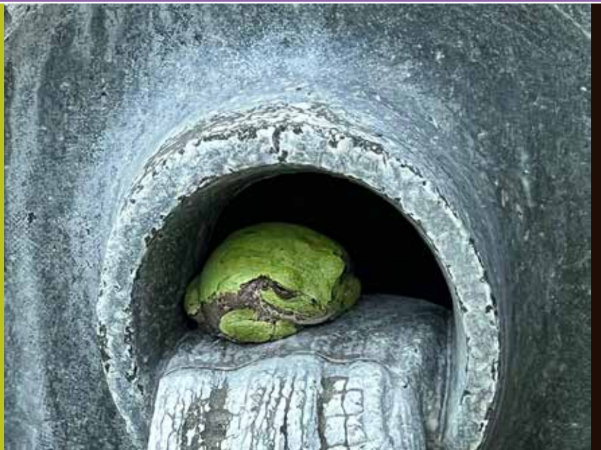
2023-2024 2nd Place Winner