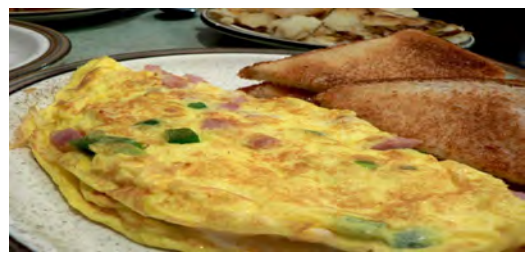
Serving 9:00 a.m. - 1:p.m.

St. Francis de Sales Catholic Church 501 N Brown St., Winthrop MN