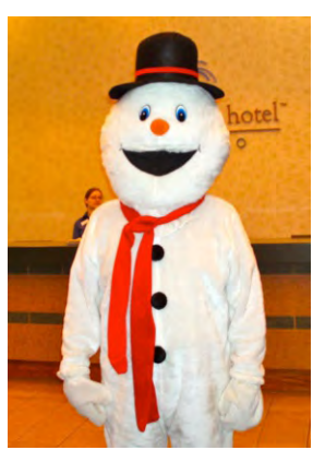
5M Lions Snowman Mascot