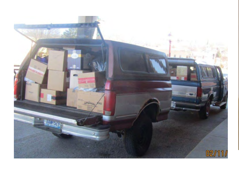
5M2 Clubs donated eye glasses at convention.