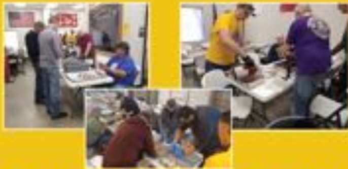
Thursday, April 25 - Prep for the Game Feed