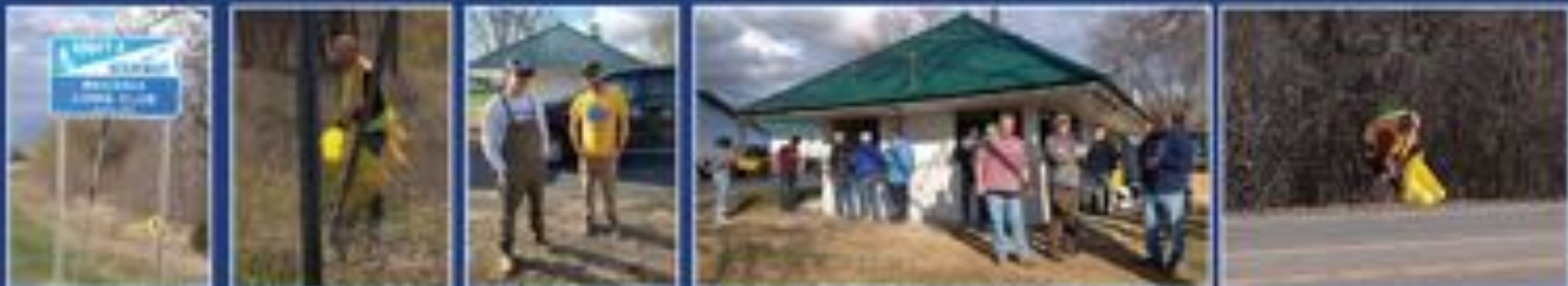
Tuesday, April 23rd - Spring Ditch Cleanup and Walleye Dinner