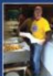
Saturday, April 27 - Wild Game Feed & Sportsman Dinner