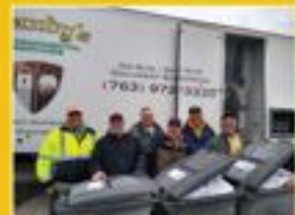
Saturday, May 4 - Free Document Shredding