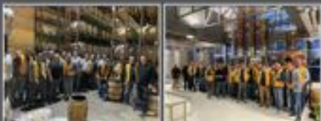
Tuesday, April 16 - Club Meeting at J Carver Distillery