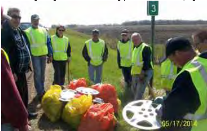
Silver Lake Lions Get Down and Dirty on Saturday, May 17, the Silver Lake Lions had a good crew put together to clean the highway ditches. Looks like they found some "treasures".