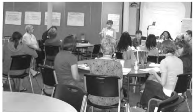
Lions quest teacher training