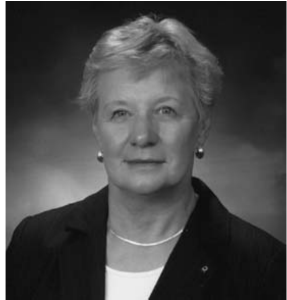
District Governor Eunice Rucks