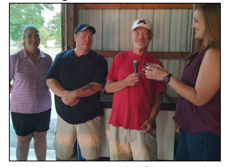
Hamburg Lions also served root beer floats at National Night Out.