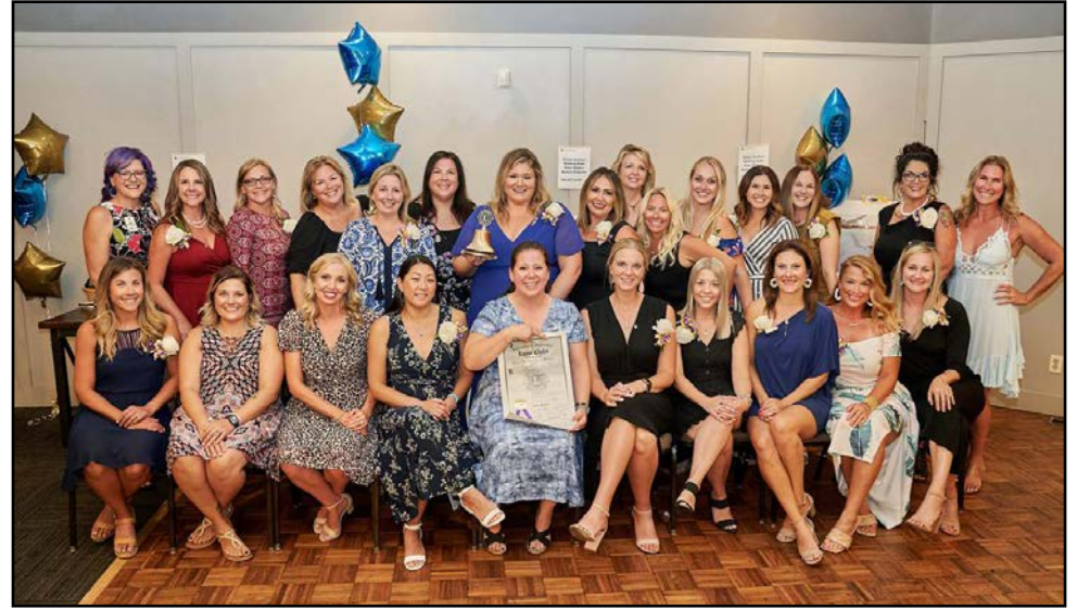
The Waconia DandyLions officially became members of the Lions Club International, the world's largest humanitarian organization, on Monday, August 16, 2021. They're truly living up to their namesake and "Growing Like A Weed" with 38 members and counting. They look forward to continuing to serve the local community by focusing on women, family and children's health and wellness needs. Congratulations to the new club!