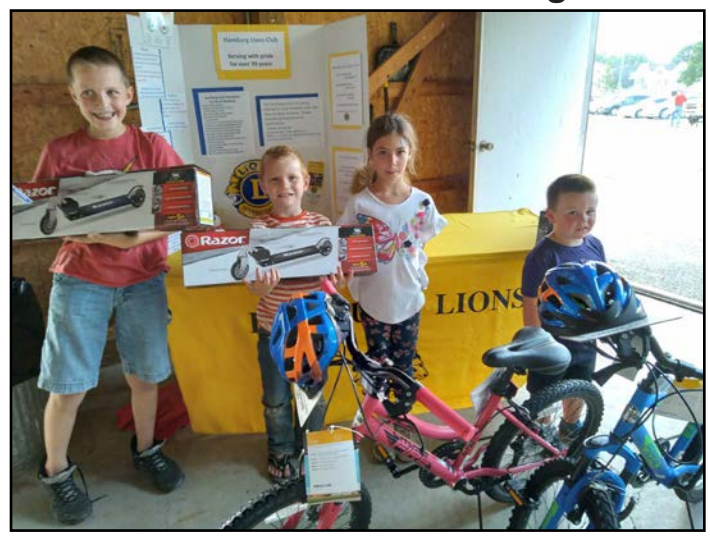
Hamburg Lions made 6 children happy at National Night by giving away 2 bikes, 3 scooters and 3 helmets. Pictured are 4 of the winners.