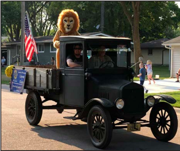
(Above) Libby the Lion was sighted at the Prairie Days parade.