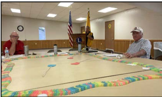
(Left) An empty track.