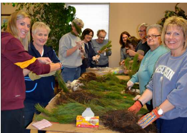
The Jordaness Lions are pictured bagging trees to present to the Kindergartners in the Jordan Public School and St. John's Catholic School.