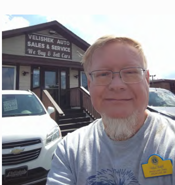
Velishek Auto https://velishekautosales.com/