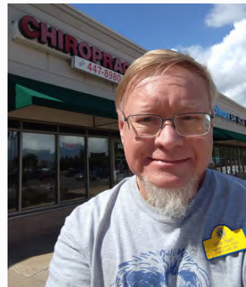
Chiropractic Center https://www.savagechiropractor.com/