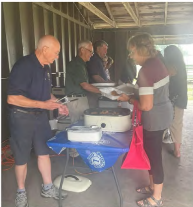
WORKERS BUSY SERVING THEIR PATRONS.