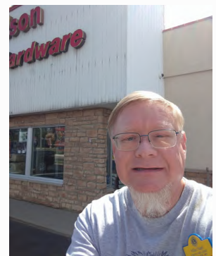
Carlson Ace Hardware https://www.acehardware.com/store-details/03078