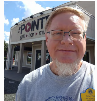
The Pointe http://thepointegrillandbar.com/