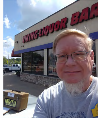
Viking Liquor Barrel https://vikingliquor.com/