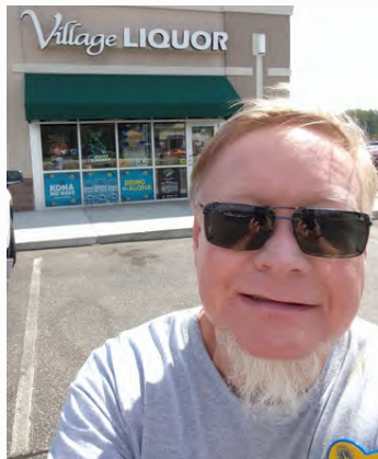
Village Liquor https://www.priorlakeliqor.com/