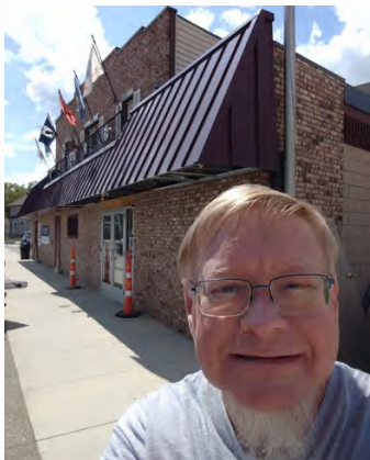
Prior Lake VFW Post 6208 https://vfwpost6208.com/