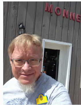
Monnens Lumber Supply https://www.handle.com/supplier/monnens-lumber-supply-07bb/