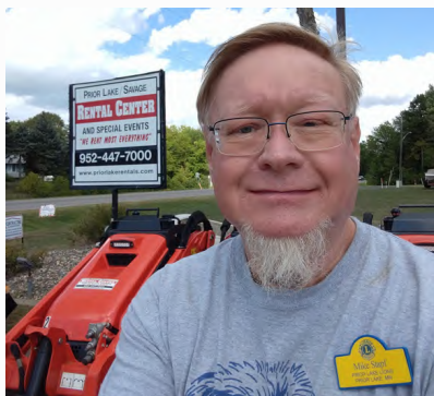
Prior Lake/Savage Rental Center https://priorlakerentals.com/equipment-rentals.asp