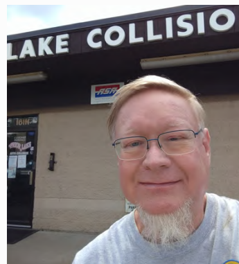
Prior Lake Collision https://www.priorlakecollision.com/