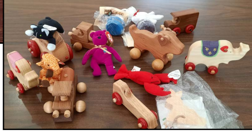
bies, wooden cars, trains, and helicopters, crayons, puzzles, small games, and much more. A committee of Jordaness Lions work to sort and distribute these items to organizations in and around the Jordan area (even extending to children's hospitals in

Every year our club receives 1500 – 2000 items including toys, books, beanie ba-