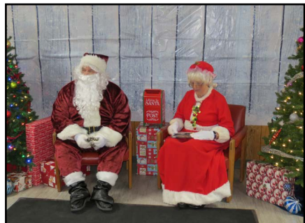
Santa and Mrs. Claus are ready to hear the wishes of the little boys and girls.