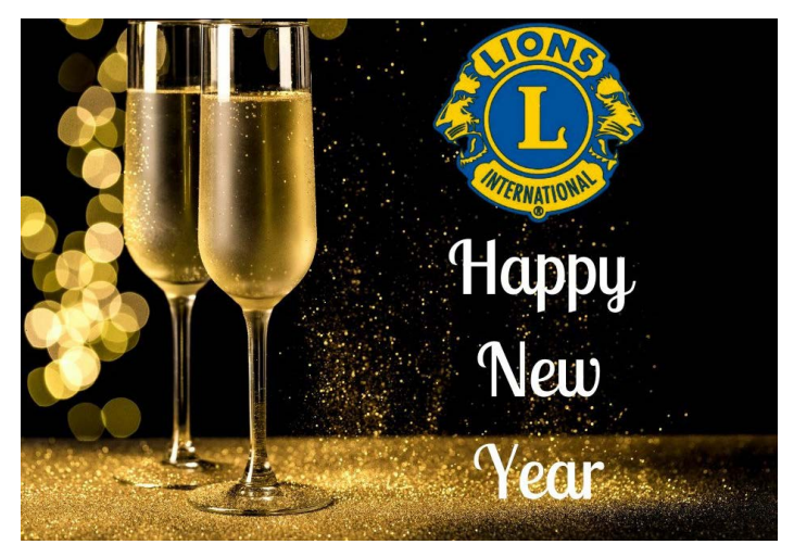
Interested in Bussing to International Convention?

You can contact me at: 952-261-8581- phone or Christy1135@gmail.com