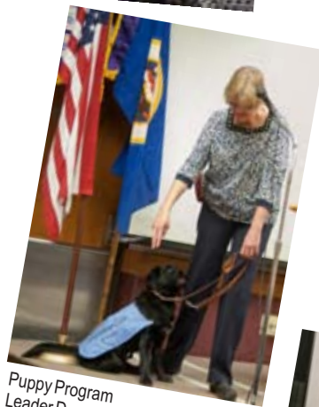
Puppy Program Leader Dog.