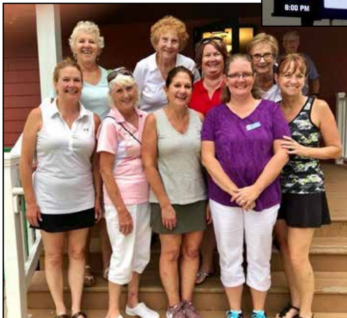
Above: The Jordaness Lions and the Jordan Lions came together for our annual social outing together. 60 Lions and guests boarded 2 school buses and traveled to St. Paul to attend a St. Paul Saints game. A great night for baseball and for socializing together!