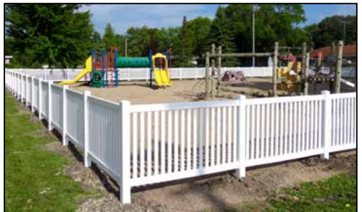
The completed fence makes an attractive enclosure for the kids play area.