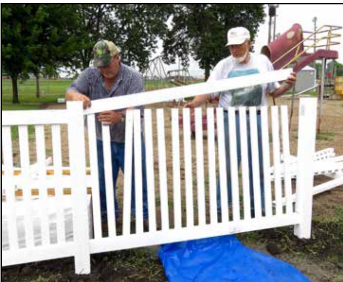
Fence assembly was pretty simple. After the posts were in place, a bottom rail was installed between them, pickets inserted into pre-made holes, the top rail put in place over the pickets, then that was hooked into the posts.