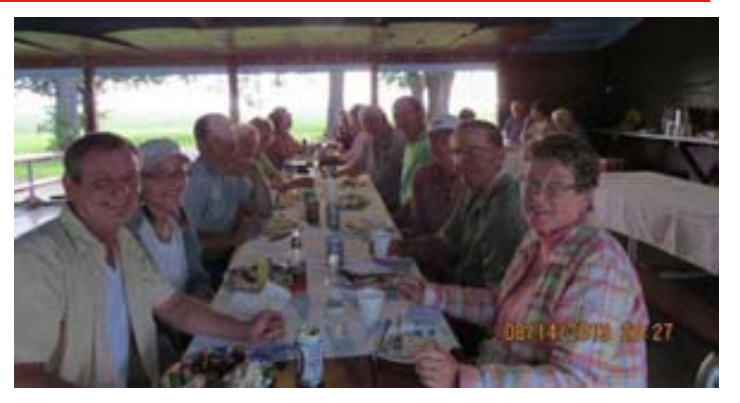
Minnesota Lake Lion members and guests at the Old Mill Park in Minnesota Lake.

The Minnesota Lake Lions held their annual club picnic at the Old Mill Park on Wednesday August 14. We had a Pot Luck supper with the meat and beverage furnished by the Club. There was 26 members and guests present. Our next meeting will be Wednesday September 11, 2013. We will meet at 6:15 A.M. at the Old Mill Bar and Grill. Come early for breakfast. People interested in learning about our club are always welcome to join us.