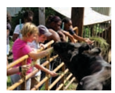
The campers and counselors were excited to feed hay to the steers at Al Guggisberg's farm.