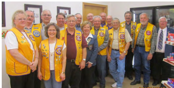
Governor Sue Bowmen visits with Montgomery Lions