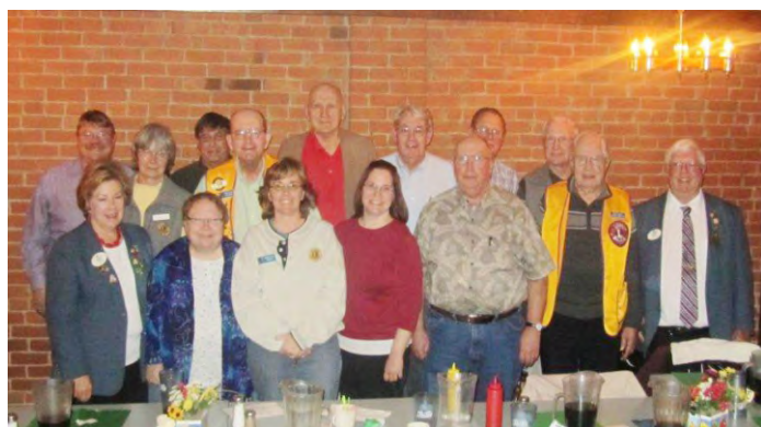
Mankato and Mankato Key City Lions Club Visit