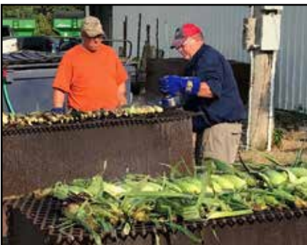
It's a hot job, but the Lions get the corn roasted "just right" for the crowd.