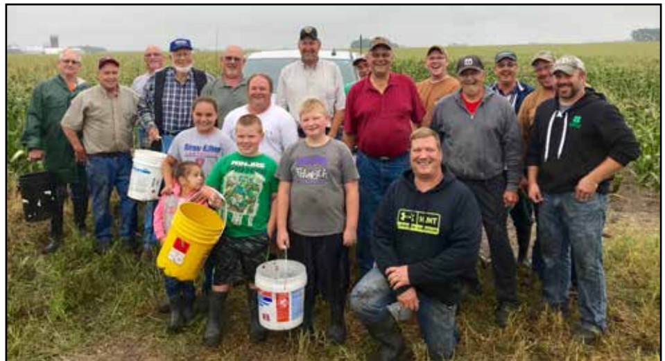
The Lions – along with family members – paused for a photo after loading up the trailer with corn.