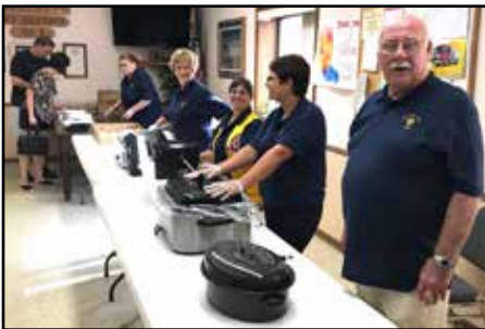
The Lions were ready to serve the hungry diners.

The Lions were out early Saturday morning, heading into an area cornfield to pick corn. With delayed planting due to the weather, finding a field that was ready was difficult, but they found one field near Lafayette that was just right. The Lions reimburse the owner for the value of the corn.