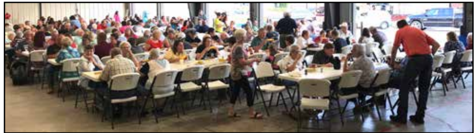
The event fills the Lafayette Fire Hall several times over. This year's roast served about 415 people – including a class reunion of the 1970 sixth grade class at Lafayette Public School.