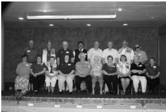
Group photo of the new Winsted's Lions Club at their charter night.