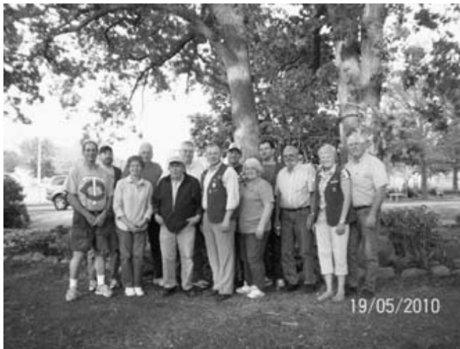
Minnesota Lake Lions after Jazz in the Park 2010.