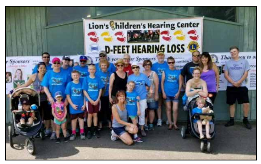
For the third year in a row the Jordaness Lions were Silver Sponsors and participants at the D-Feet for Hearing fund-raising event held in June. We, along with our families are proud to join lions from across the multiple in raising awareness and funds to needed for research, clinical care, and programs for children inflicted with various levels of hearing loss.