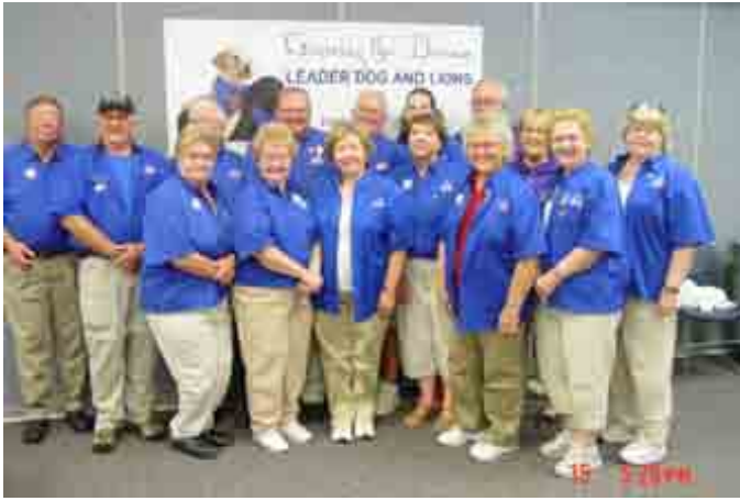
This is the group from 5M that toured Leader Dogs for the Blind in Rochester, Michigan.