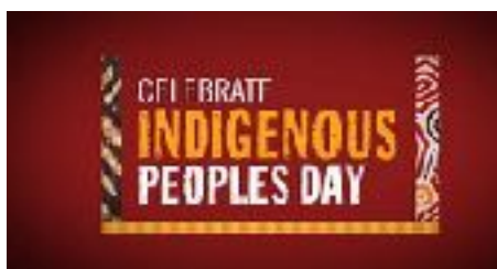
October 9 - Office Closed