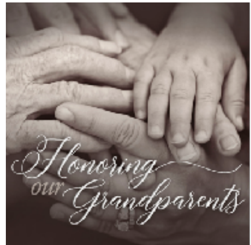
Grandparents Day, September 10

participants. The idea is to discuss how the readings are understood and can be used in modern society. Anyone can join us any Sunday Morning. If casual attendees would like each Sunday's reading material, they give me their email address and I send it to them during the week. During the session I let the discussion go in any direction the group sets but I try to stay close to the readings and commentary."