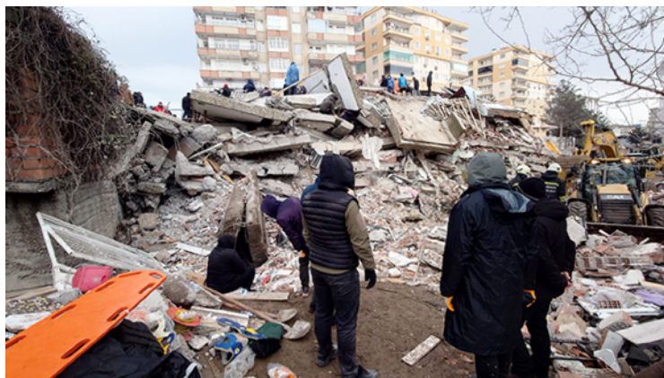
The wreckage of a collapsed building, Diyarbakir, Turkey.

The Mountain Rise UCC Service and Advocacy Committee has agreed to be a part of this Recovery Effort by giving the Mountain Rise Easter Offering to the National UCC Disaster Relief for greater impact. The need is great and the need is now. Your donation will get to the people affected before Easter. Donations may be made by check to Mountain Rise, or online at mtriseucc.org . Please indicate it is for Earthquake Response / Easter Offering.