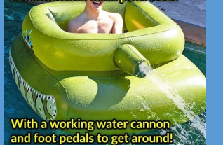
With a working water cannon and foot pedals to get around!

PING PONG HUNT: There are many Contests you can do during Set Aside Time ". Here, the balls are painted with a colored dot. Teams or Indiv race to find their balls. Lose pts for wrong balls. Most pts = Prize.