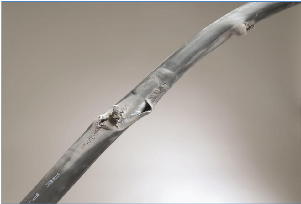
Figure 2. Heat-shrink tubing can be used to repair worn and damaged wire and cable.

Tubing is typically made by forming a tube and exposing it to intense radiation (irradiated), during which it is expanded to a larger size. The expanded tubing is what you buy. The expanded tubing has “memory,” so that when it is heated it will return to its original state.