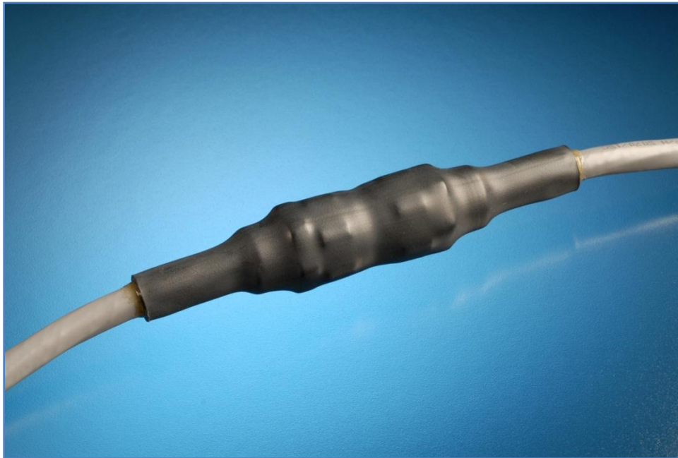
Figure 3. Heat-shrink tubing can be easily applied to irregular surfaces

Apply heat evenly, often moving the heat gun from one end of the tube to the other works well. You should also apply heat in a full 360° around the tubing. This may not always be possible, but cover as much of the tubing with heat as possible.