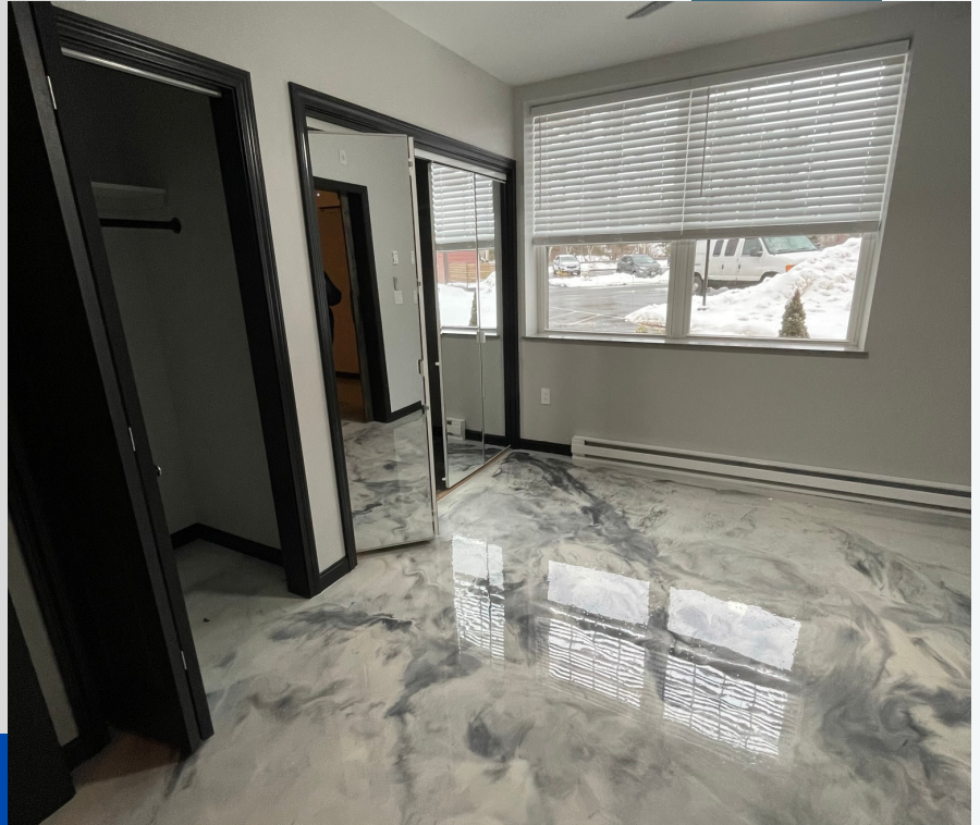
Bedroom with clothing closet and washer/dryer closet.

Future amenities will include a dog wash station and tenant gym.