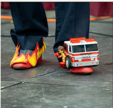
2023 Best Shoes