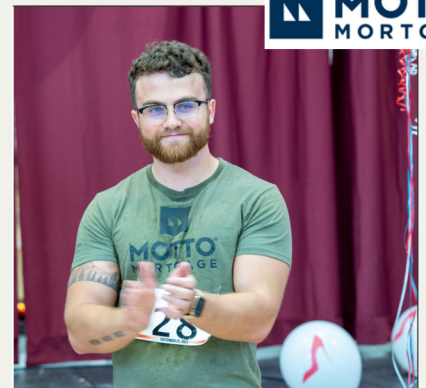
2023 Top Fundraiser