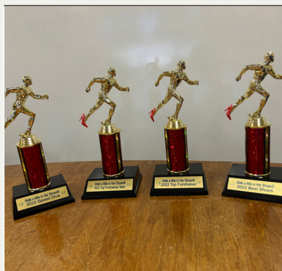
Who will win in 2024?