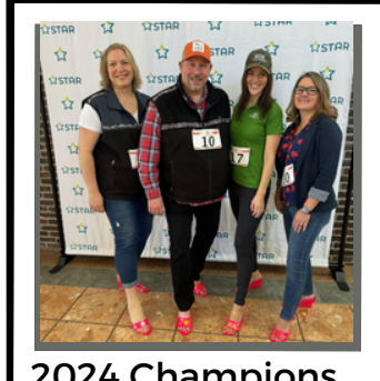
2024 Champions Top Team