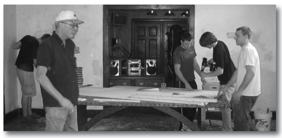
A scene from Delta Day 2006.