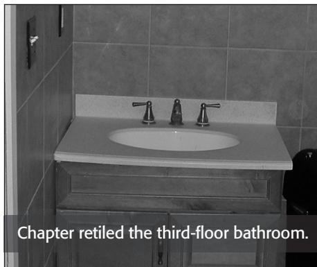
Chapter retiled the third-floor bathroom.

Once we get through these two hurdles, it is our plan to replace the windows that are in the