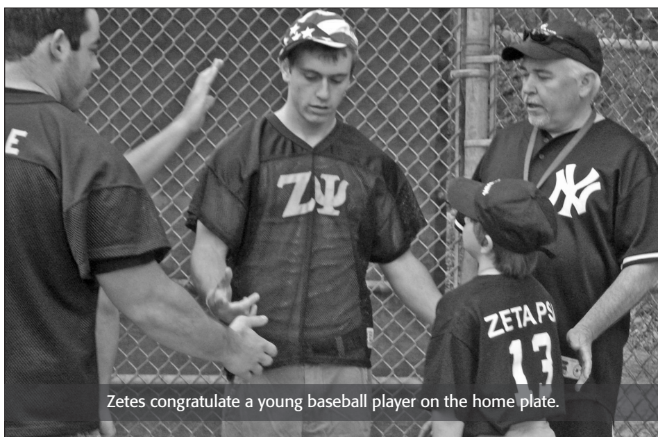
Zetes congratulate a young baseball player on the home plate.

P.S. I am proud to share with the alumni that our team won the championship by a score of 5-1!