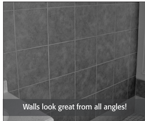
Walls look great from all angles!

Whenever extra funds are available—thanks to the generosity of you, our alumni—we try to