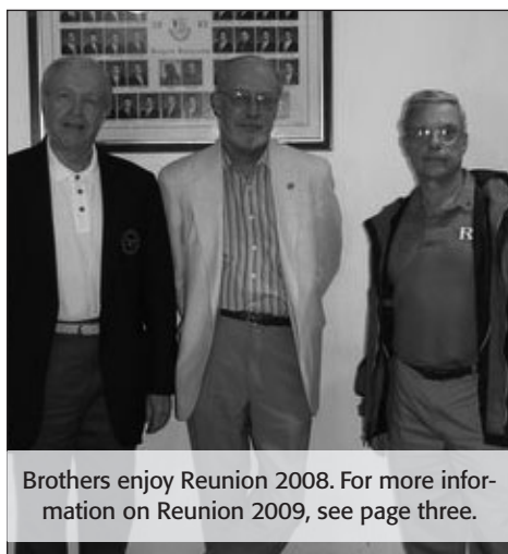
Brothers enjoy Reunion 2008. For more information on Reunion 2009, see page three.