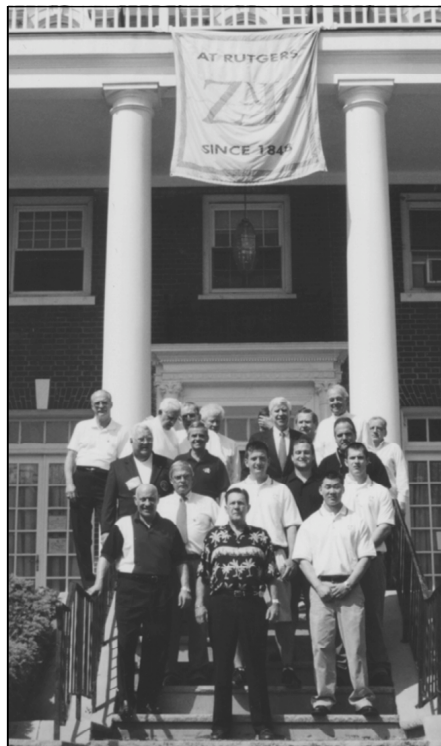
Elders pose out on the front steps during Delta's annual meeting, 2004.

This is becoming a bi-annual opportunity for elders, brothers, and pledges to give back to the Delta, the "Mother of all Chapters." All pitched in on April 3 to work outside, clean up the front flower beds from a harsh winter, and paint the main hallway and parts of the Blue room. Fortunately, there was a strong and dedicated pledge class that was giving back throughout the spring semester.