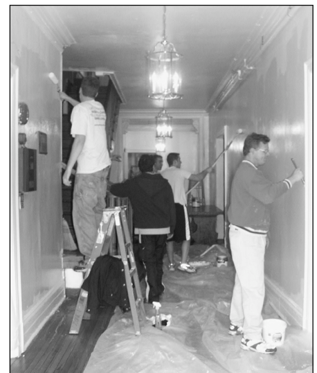
Brothers and elders work together at the spring Delta Day, 2004.

All elders who graduated in years ending in a "5" or "0" are encouraged to return to the Banks and 18 College Avenue.