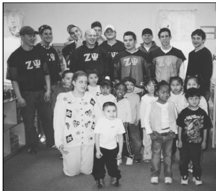
Delta brothers with the kids at the Tiny Tots Spot daycare center.

As a result of the silent auction, the Delta was able to give back to the community $1,000 to the Tiny Tots Spot, a local daycare facility. Approximately half of the donation went toward the expansion of their library and computer software collection. The other half went toward books the children were able to take home and enjoy with their families. Also,