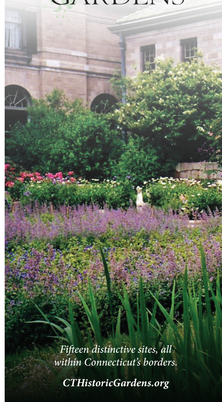
Phelps-Hatheway House & Garden 55 South Main Street, Suffield, CT 06078 www.CTLandmarks.org | 860.668.0055