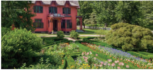
Webb-Deane-Stevens Museum 211 Main Street, Wethersfield, CT 06109 www.Webb-Deane-Stevens.org | 860.529.0612