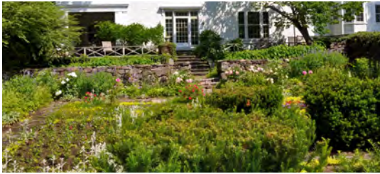
Thankful Arnold House Museum 14 Hayden Hill Road, Haddam, CT 06438 www.HaddamHistory.org | 860.345.2400