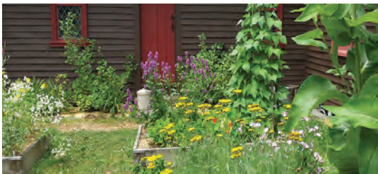
Weir Farm National Historic Site 735 Nod Hill Road, Wilton, CT 06897 www.nps.gov/wefa | 203.834.1896