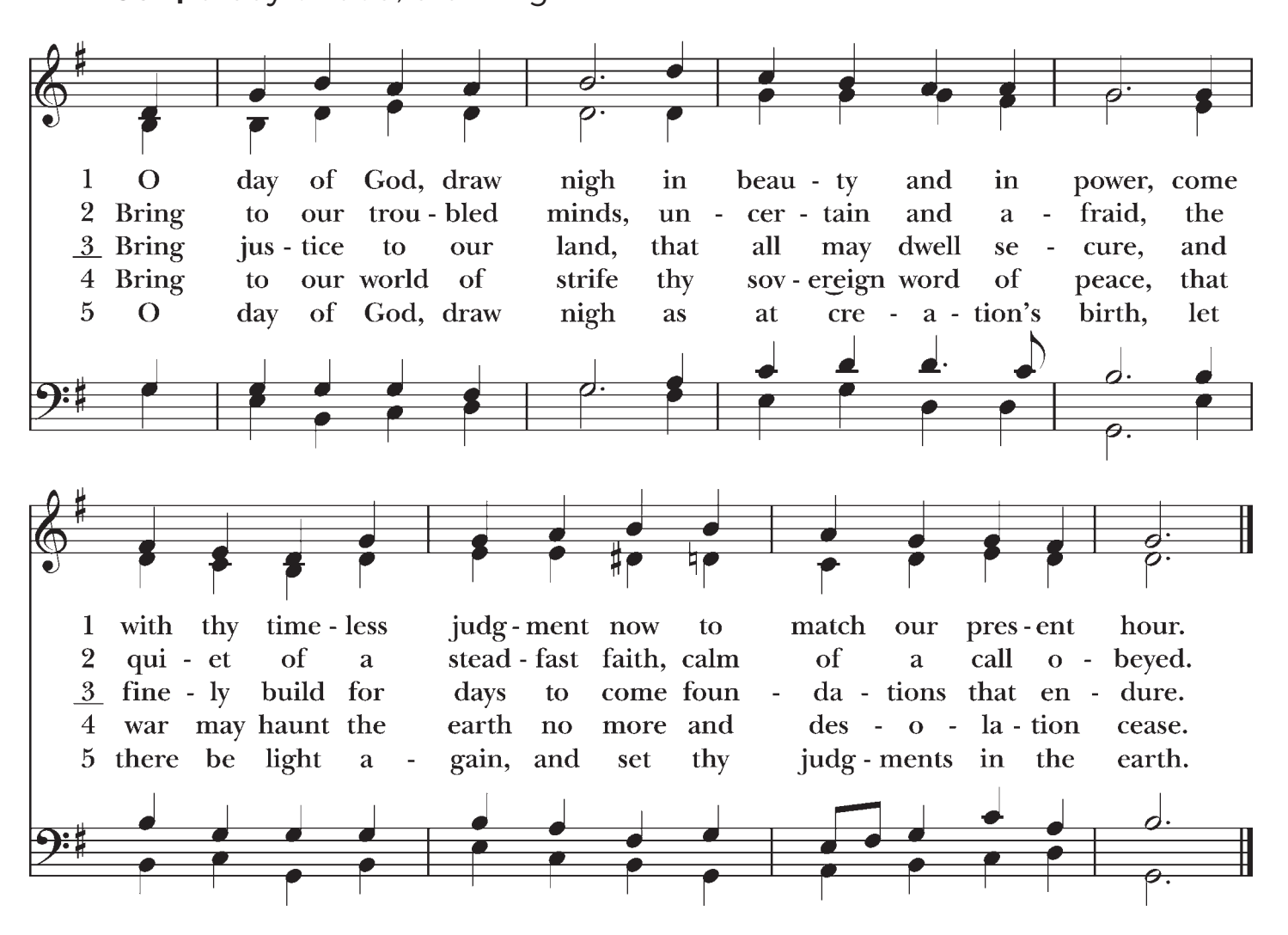
601 O day of God, draw nigh