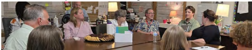
1st grade teachers meet with NLP steering committee