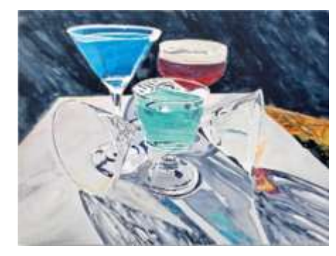
Tuni Weiss "5 O'Clock Shadows"