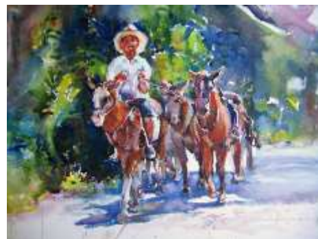
Lois Newman "Beach Trails"