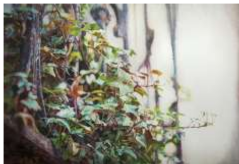
Xi Guo "Vines on Gate"