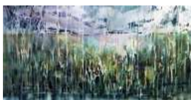
"Fresh Air" Jennie Szaltis