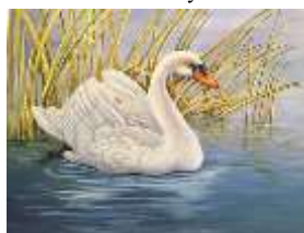
"Meditation" Lynne Mayhew