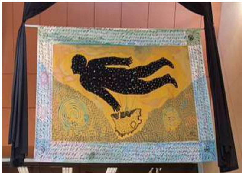
Nelson Mandela International Airport Tapestry

When we landed in South Africa there was a huge set of murals about Mandela. Huge! I was looking at it and said to the young lady who was pushing my wheelchair just how beautiful it was. She said, “You know about Mandela?” I said, “ Everybody in America knows about Mandela”. We were home together.