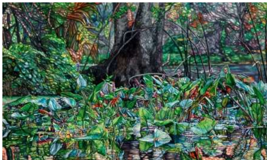
"Silver River, Silver Springs" Watercolor H 33#"W51"

Her large, sparkling watercolors reflect her wish "to paint that which is beautiful in nature"...creating "a window to the natural world through which the viewer has a heightened awareness of its beauty."