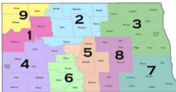
ND CattleWomen District Map

If you live in an inactive district, you can still contribute membership dues.