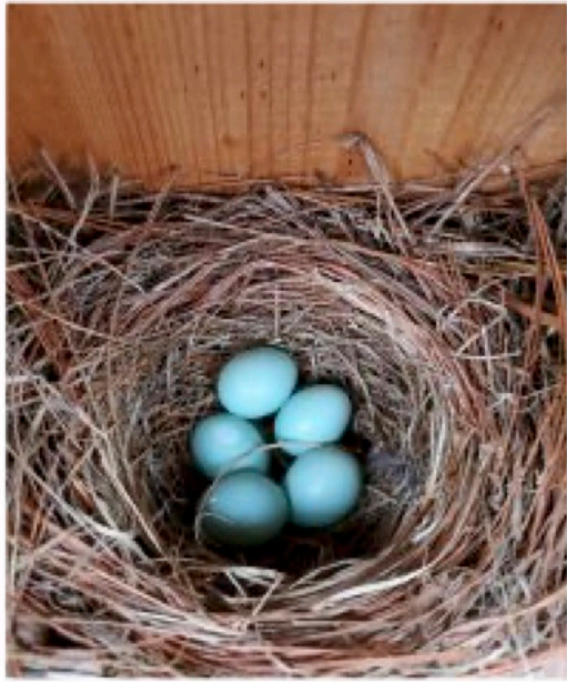
Welcome Sights This Spring and Summer

A Quarterly Publication for Members of the TN Bluebird Society