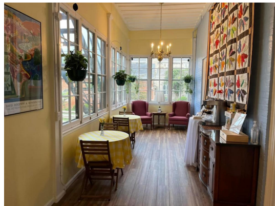
The Sunroom set up with refreshments