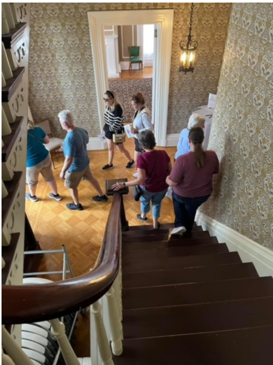
A group checking out the 2nd floor

A SPECIAL THANK YOU GOES OUT TO EVERYONE WHO HELPED MAKE ST. PAUL'S HISTORIC HOME TOUR A HUGE SUCCESS!!!