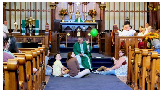
"Bob the Balloon" becoming "Flat Bob".