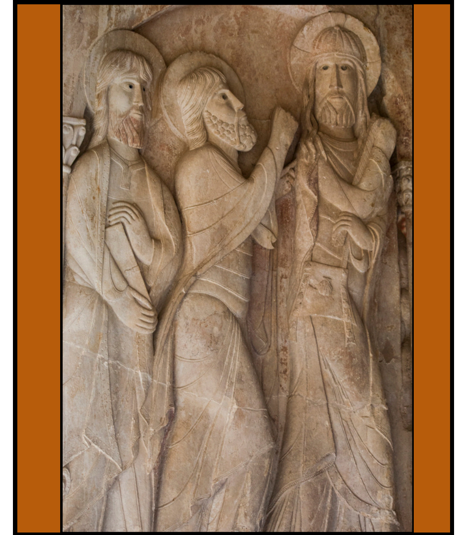
Christ and the Disciples Walking to Emmaus , Monasterio de Santo Domingos de Silos, Spain. from Art in the Christian Tradition , a project of the Vanderbilt Divinity Library, Nashville, TN.